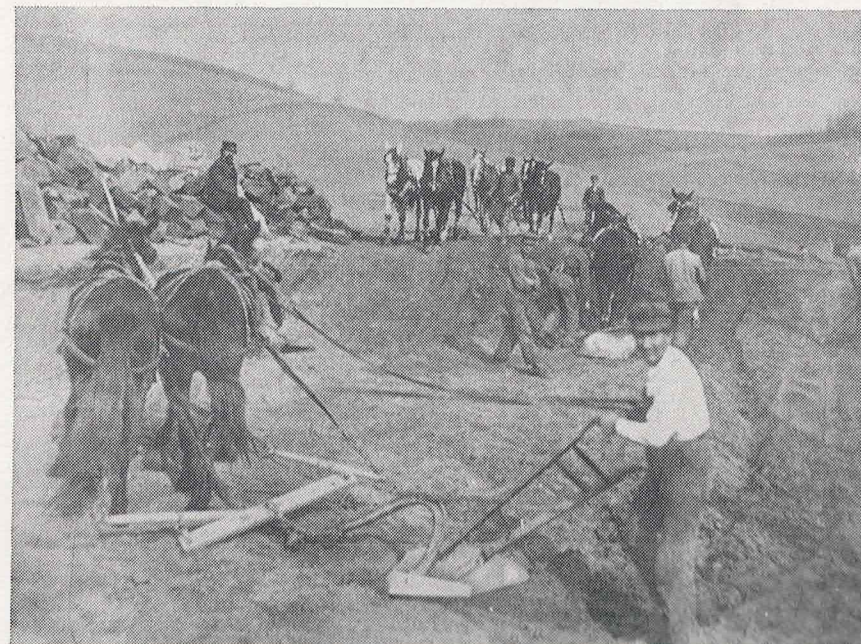
Digging of church basement in the year 1911

Under the leadership of Pastor Folkestad, a sewing circle was organized March 29, 1913, which continued until 1937. The circle was made up of young women of the congregation who sold their handiwork locally, the proceeds of which went to the China mission.